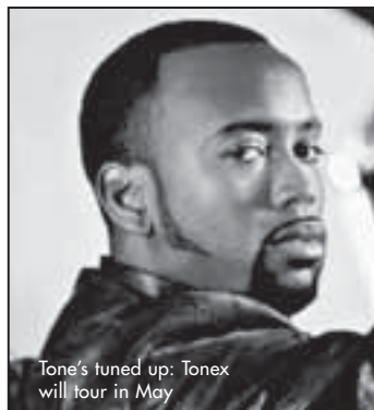
Tonex is tuned up: Tonex will tour in May

Gospel's new star is giving his genre an exciting change of direction