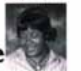
Minister Juliet Bello

Located at The Elephant & Castle Shopping Centre New Kent Road, London